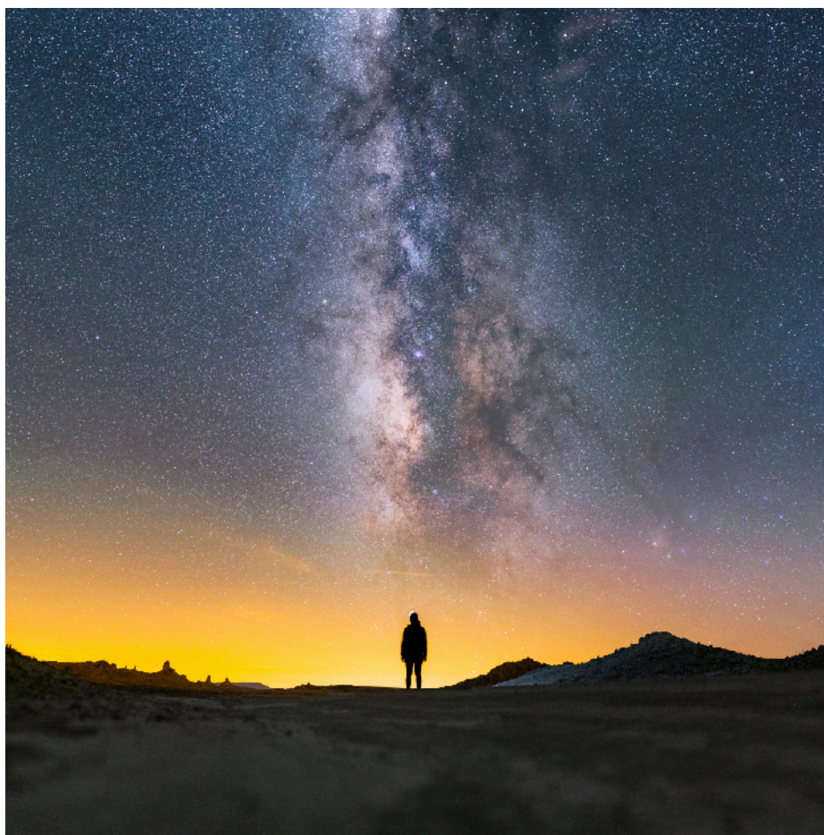
Figure 1.10 Milky Way Galaxy. Because we are inside the Milky Way Galaxy, we see its disk in cross-section flung across the sky like a great milky white avenue of stars with dark “rifts” of dust. In this dramatic image, part of it is seen above Trona Pinnacles in the California desert.

Typically, the interstellar material is so extremely sparse that the space between stars is a much better vacuum than anything we can produce in terrestrial laboratories. Yet, the dust in space, building up over thousands of light-years, can block the light of more distant stars. Like the distant buildings that disappear from our view on a smoggy day in Los Angeles, the more distant regions of the Milky Way cannot be seen behind the layers of interstellar smog. Luckily, astronomers have found that stars and raw material shine with various forms of light, some of which do penetrate the smog, and so we have been able to develop a pretty good map of the Galaxy.