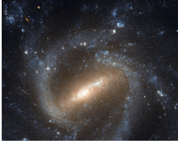
Figure 1.9 Spiral Galaxy. This galaxy of billions of stars, called by its catalog number NGC 1073, is thought to be similar to our own Milky Way Galaxy. Here we see the giant wheel-shaped system with a bar of stars across its middle.

Our Galaxy looks like a giant disk with a small ball in the middle. If we could move outside our Galaxy and look down on the disk of the Milky Way from above, it would probably resemble the galaxy in Figure 1.9 , with its spiral structure outlined by the blue light of hot adolescent stars.