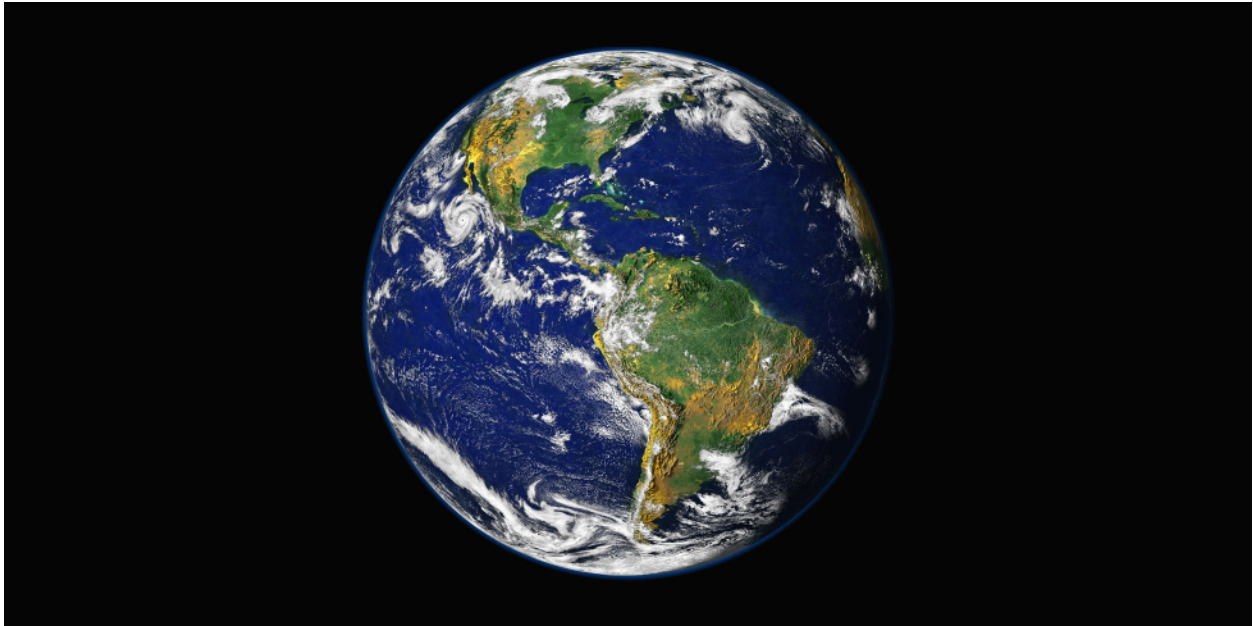
Figure 1.6 Humanity's Home Base. This image shows the Western hemisphere as viewed from space 35,400 kilometers (about 22,000 miles) above Earth. Data about the land surface from one satellite was combined with another satellite's data about the clouds to create the image.

Our nearest astronomical neighbor is Earth's satellite, commonly called the Moon . Figure 1.7 shows Earth and the Moon drawn to scale on the same diagram. Notice how small we have to make these bodies to fit them on the page with the right scale. The Moon's distance from Earth is about 30 times Earth's diameter, or approximately 384,000 kilometers, and it takes about a month for the Moon to revolve around Earth. The Moon's diameter is 3476 kilometers, about one fourth the size of Earth.