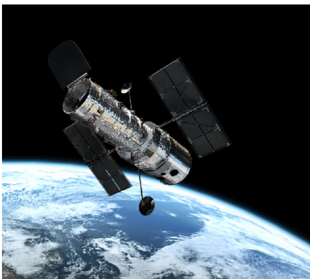
Figure 1.5 Telescope in Orbit. The Hubble Space Telescope, shown here in orbit around Earth, is one of many astronomical instruments in space. (credit: modification of work by European Space Agency)

This is one reason why astronomers strive to build telescopes that can collect more and more of the faint light in the universe. The more light we collect, the fainter the objects we can observe. On average, fainter objects are farther away and can, therefore, tell us about periods of time even deeper in the past. Instruments such as the Hubble Space Telescope ( Figure 1.5 ) and the Very Large Telescope in Chile (which you will learn about in the chapter on Astronomical Instruments ), are giving astronomers views of deep space and deep time better than any we have had before.